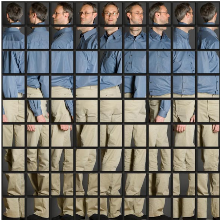
Point of View I, 2008 (version 1) Eighty-one fine-art prints, framed 9 x 9, 20 x 20, or 30 x 30 cm each

But it doesn't end here: there are an endless variety of ways to display the images, two of which are presented here. We have consciously left it open.